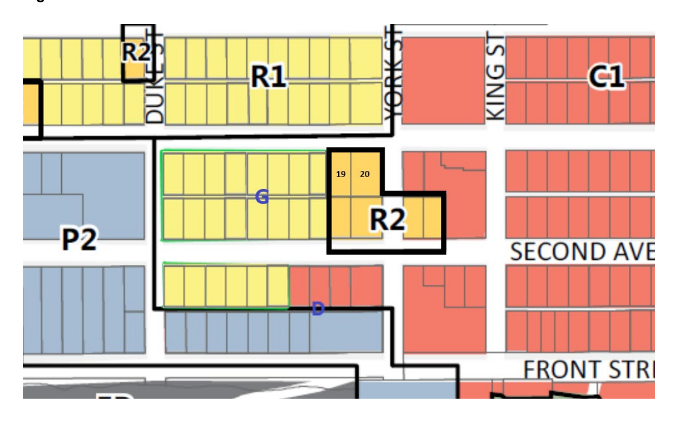
Figure 1. Amended area